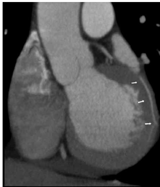
Fig. 1. Reformatted semicoronary image showing intramyocardial trace of long segment of the first obtuse marginal branch